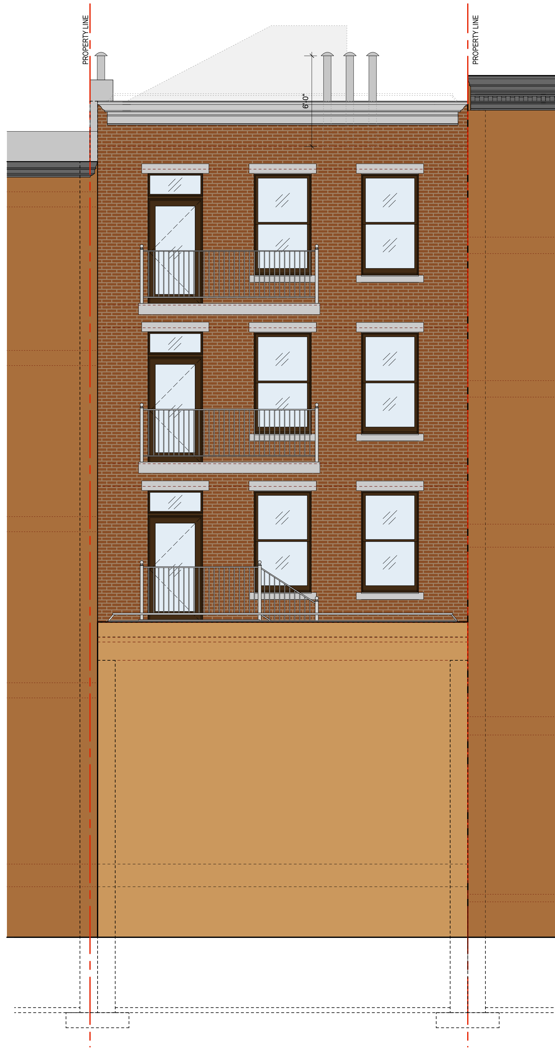
3 Proposed Back Elevation 1/4" = 1'-0"