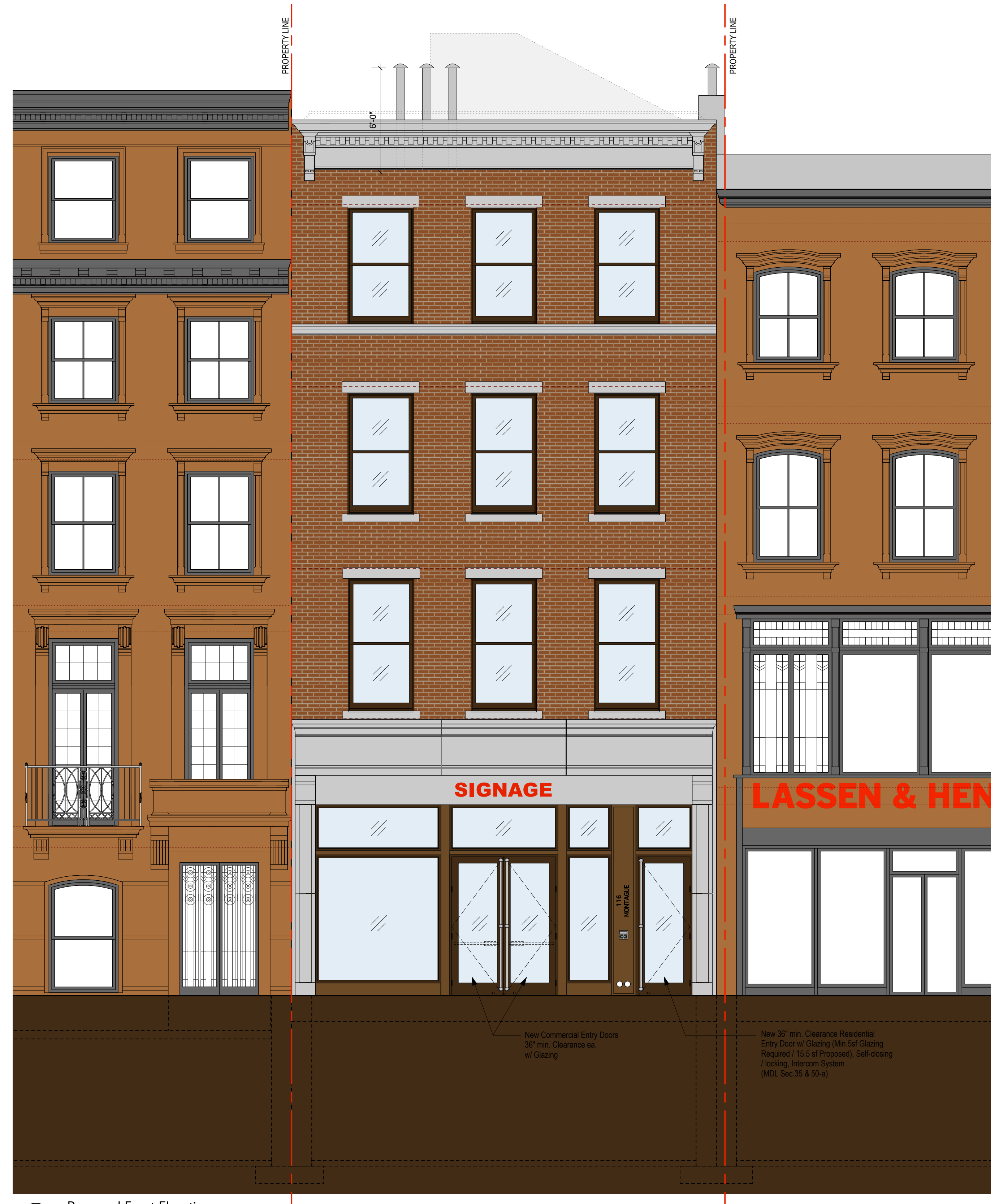
1 Proposed Front Elevation 1/4" = 1'-0"